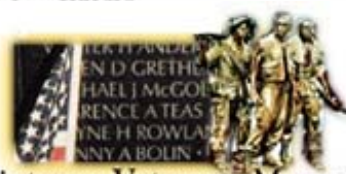
The Vietnam Veterans Memorial